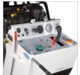
Neutral gear position provides for extra safety when moving saw