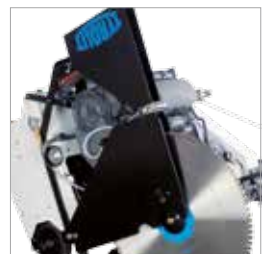
Patent pending hydraulic handle adjustment provides better control and less fatigue